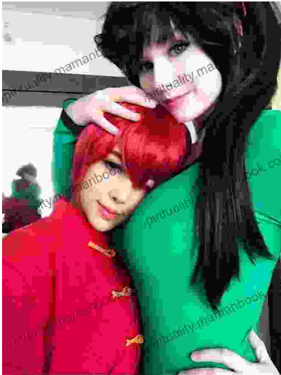
Figure 2: Shinichi and Marin's shared interest in cosplay fosters a bond of friendship and mutual respect.

In Episode 03, Shinichi is tasked with designing and creating a costume for Marin. As he works tirelessly on the project, he grapples with the concept of authenticity. Initially, he feels the need to conform to the expectations of others, believing that his own ideas are unworthy of attention. However,